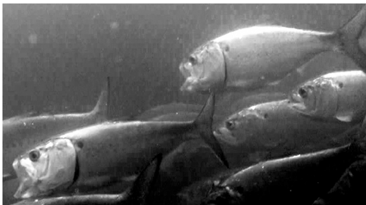
Figure 5. School of menhaden, Baltimore Inner Harbor, July 2010. SONY HDR-XR500V in underwater housing.

Omega 3s claims as a defense against ailments are far and wide - from heart disease to depression. Since 2006 the