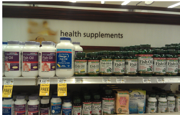
Figure 1. Selection of fish oil supplements on grocery store shelf

Stroll through the vitamin and health supplements aisle at the grocery or pharmacy and take a look at the fish oil capsules or other omega 3 fatty acid sources and ask yourself a question, “Where do these natural compounds come from?” The answer, as well as the impact on the environment, may be surprising.