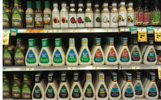
Figure 3. (Top) Selection of salad dressing on grocery store shelf

Table 1 below lists some omega fatty acid food sources.