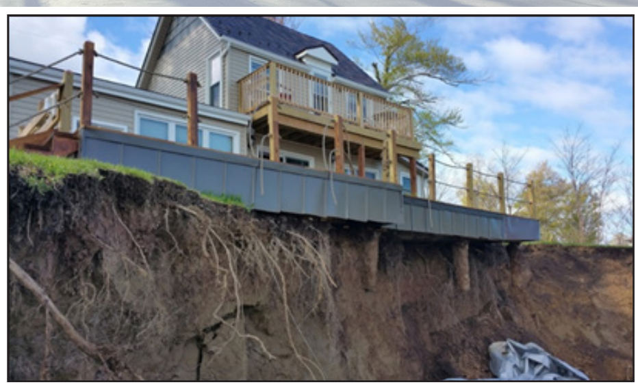
Major erosion and property damage along the shoreline of Lake Ontario.

to address all of these concerns but the public was not in favor of any of them. In 2014, the IJC proposed another plan for lake level management that incorporated more environmental concerns and presented it to the federal governments of the U.S. and Canada.