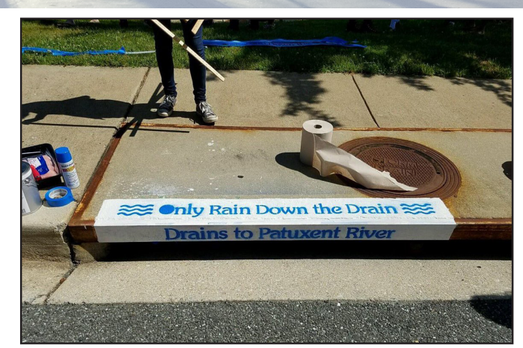
Need we say more?

highlight how storm drain systems do not discriminate on what they take in and try to transport downstream, the city's Public Works Department is considering what to do, including temporarily blocking storm drain inlets to keep more beads out.