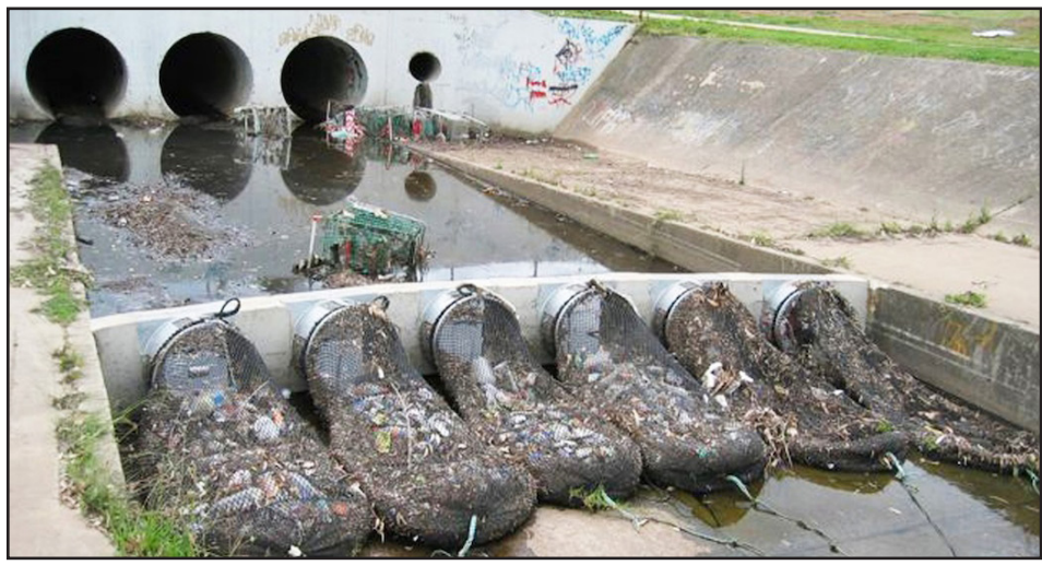
A series of nets used in a storm drain system in California to prevent trash from reaching local streams and the coast.

"Storm drain systems do not discriminate on what they take in and try to transport downstream."