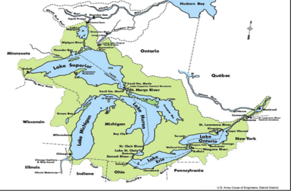
Map of the Great Lakes Basin with drainage area in green.