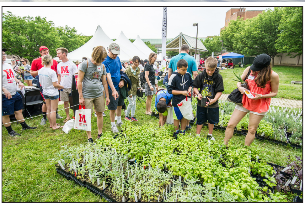
Visitors looking to pick up plants at the University of Maryland Ag Day will soon realize that healthy soils are important.

"The word 'sustainability' no longer holds much meaning for people."