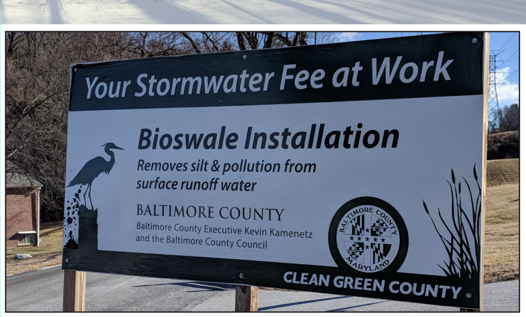
Stormwater fees are used to support the implementation of infrastructure, such as bioswales. Baltimore County phased out its stormwater fee in 2017.

"The repeal of HB 987 in 2015 did not change the MS4 municipalities' regulatory requirements or the cost of meeting those requirements."