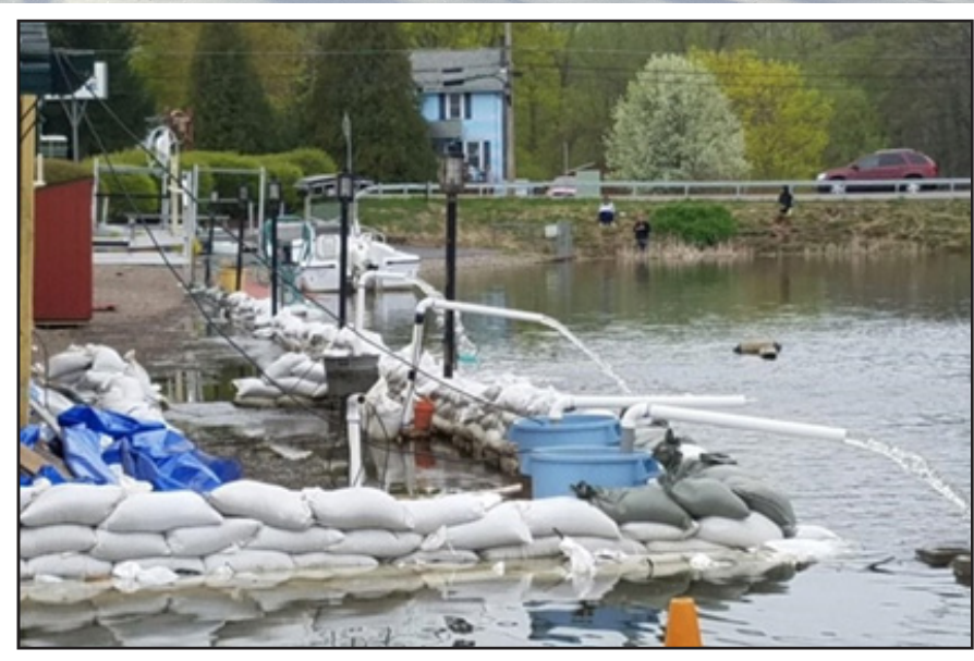
Flooding at Arney's Marina located in Wayne County, NY.

allowed and lake levels stay where they are.